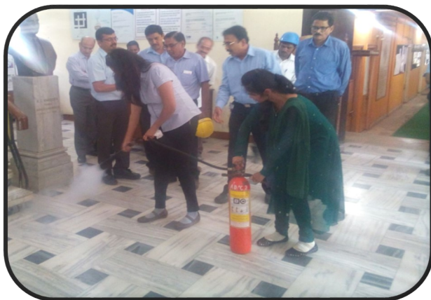
Fire Fighting Training

“To Strengthen the EHS System & to decide the common minimum program”