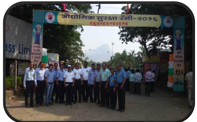
Industrial Safety Rally